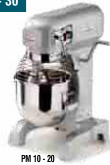
PM 10 - 20