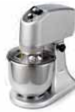
PM 7 Y15