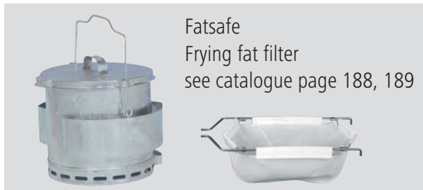
Fatsafe Frying fat filter see catalogue page 188, 189

W 600 x D 650 x H 295 mm Power: 18,0 kW / 400 V 50/60 Hz 3 NAC Capacity 2 basins each 10 litres with swivelling heating element for easier cleaning Weight: 32 kg GTIN 4015613549088 Code-No. 115205